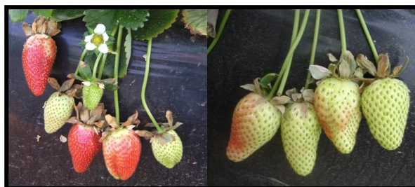
Figure 2. Strawberry dried calyx disorder in mature fruit. Huelva, Spain, 2008.

In Florida, strawberries are planted in open fields, while in Spain, they are produced exclusively under high tunnels, mini-tunnels, and passively-ventilated greenhouses. At both locations, growers plant several cultivars concurrently to achieve continuous fruit production by overlapping each cultivar production peaks. Cultivars undergo equal irrigation, fertilization and pest management programs all season long. Field observations indicated the cultivars Strawberry Festival, Camino Real, and Palomar showed the SDCD earlier and more severely than others.