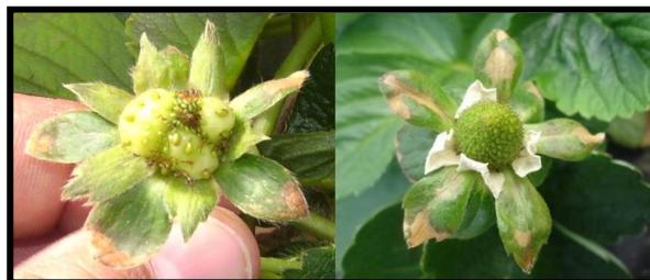
Figure 1. Strawberry dried calyx disorder in immature fruit and flower. Huelva, Spain, 2008.

burning, and fruit discoloration and deformation (Figure 2). Field surveys performed in both locations during the 2005-06, 2006-07 and 2007-08 seasons suggest that certain strawberry cultivars are more susceptible than others to the appearance of SDCD.