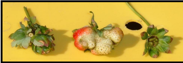
Figure 3. Strawberry dried calyx disorder reproduced under greenhouse conditions. Balm, Florida, 2007.

Circumstantial evidence seems to eliminate biotic entities (i.e. fungi, bacteria, viruses and nematodes) as the causal agents of SDCD because: a) symptoms comparable to SDCD were developed under pathogen-free greenhouse conditions; b) none of analyzed calyx samples from Florida and Spain with SDCD has yielded positive pathogen results; c) SDCD tends to disappear during the growing season when either fertigation practices are modified and/or stressful conditions disappear; and d) SDCD distribution in high tunnels and fields seems to be more accentuated in rows closer to entrances and at the end of drip lines.