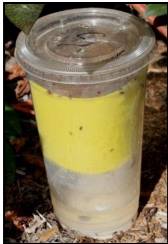
Figure 2. Plastic cup baited with apple cider vinegar for monitoring Drosophila suzukii . For best results traps should be deployed in shaded areas.

Female spotted wing drosophila possess serrations on their egg laying organ that can cut soft surfaces of sound fruit to lay eggs inside. Common drosophilid flies lack this modification and are limited to laying eggs in soft over-ripe or rotting fruit. Spotted wing drosophila eggs that hatch