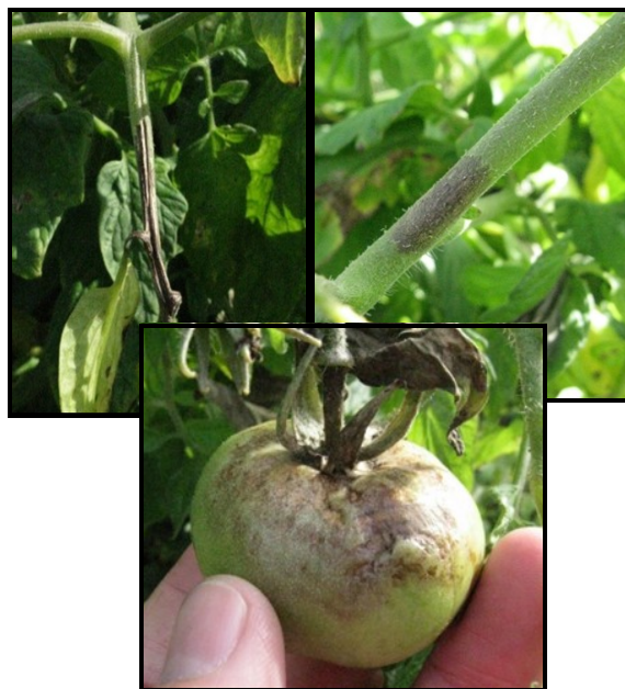
Figure 4. Symptoms of Late Blight on tomato stems, petiole and fruit.

As growers continue setting plants in the field, they should carefully check their transplants for symptoms of late blight and consider adding protective fungicides to the transplant water (such as Previcur Flex) or making protective applications immediately following planting. While late blight has not been reported in transplant facilities, conditions in such facilities are ideal for infection. Similarly, tomatoes produced in high-tunnels, greenhouses, and other protected structures also need to be on guard, as these structures often offer ideal conditions for the late blight to develop and for the pathogen to persist, especially when the relative humidity within the structure nears 90% or higher. Efforts to minimize humidity within these protected structures will help hinder disease development.