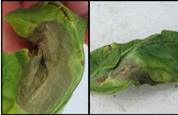
Figure 1. Tomato leaves exhibiting classic symptoms of Late Blight, caused by the fungal-like pathogen Phytophthora infestans . Note that the lesions are irregularly shaped, black to tan in color.

understand my concerns. As growers continue planting their spring crop in the area, they need to be vigilant to keep ahead of potential crop threats, especially as cold fronts approach the area.