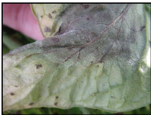
Figure 3. Closeup of late blight lesions on tomato leaves showing white sporulation of the fungal-like pathogen, Phytophthora infestans . Sporulation is easiest to see in the early morning when the relative humidity is highest.

A number of products are available for late blight control, but timing is critical. Multi-site fungicides like fixed copper (Kocide, Cuprofix), mancozeb (Dithane, Penncozeb) or chlorothalonil (Bravo, Equus, Echo) are fairly effective against P. infestans if applied preventatively prior to disease.