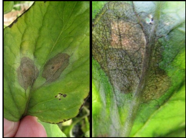
Figure 2. Close up of Late Blight lesions showing the green halo effect that can often be found around the lesion margin. Note that if held up to the light this tissue will appear darker than the surrounding uninfected, healthy tissue.

Symptoms of late blight on tomato consist of light green, water-soaked lesions that can be circular or irregularly shaped (Figure 1). Often the tissue surrounding the lesion will have an off-colored appearance, giving the appearance of a halo around the lesion and will be noticeably darker when held up to the light (Figure 2). Symptoms can appear on leaves, petioles and stems and can enlarge