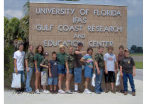
4-H Swine Club