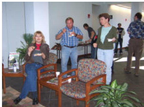
Never a party here without good food!